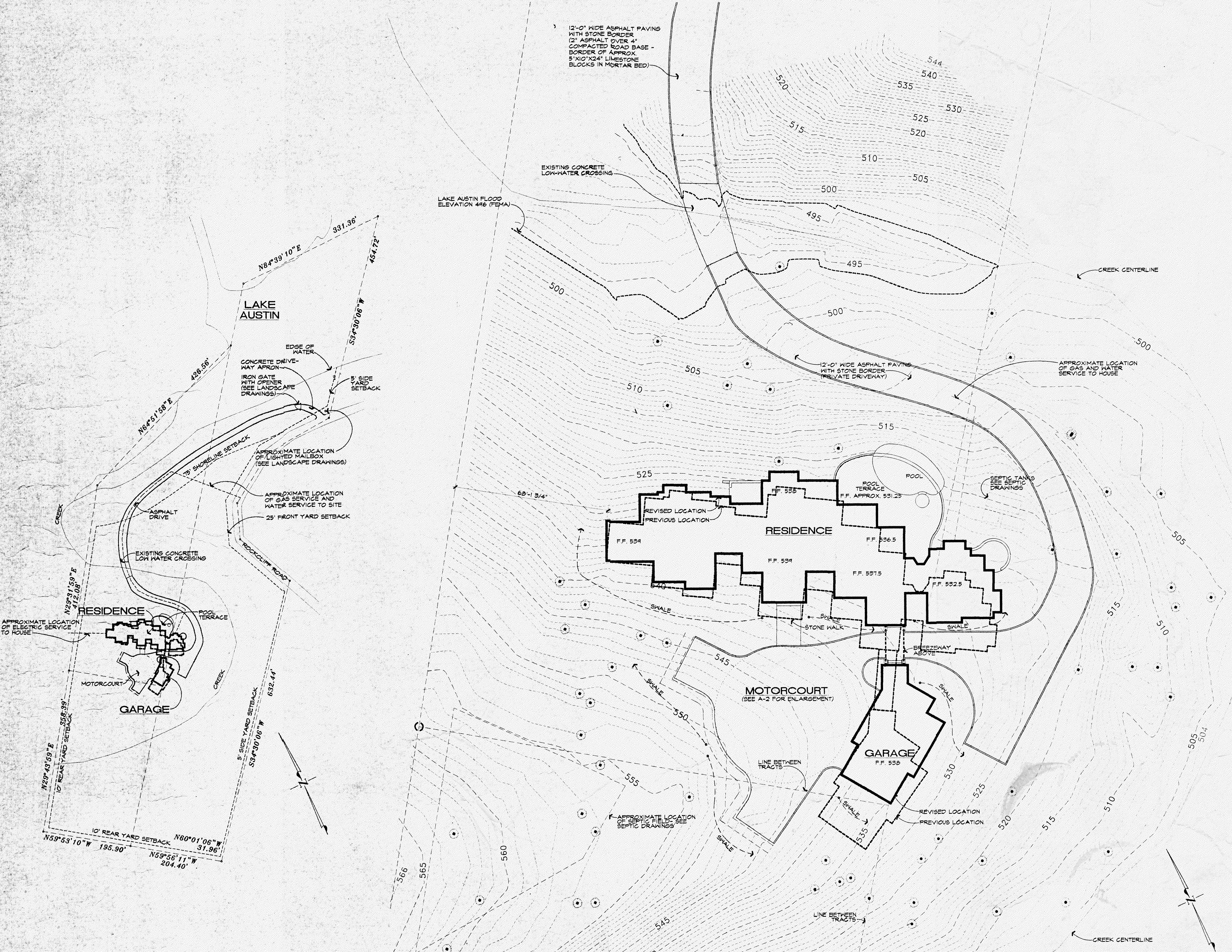
OVERALL SITE PLAN (REVISED) 1"=100'-0"